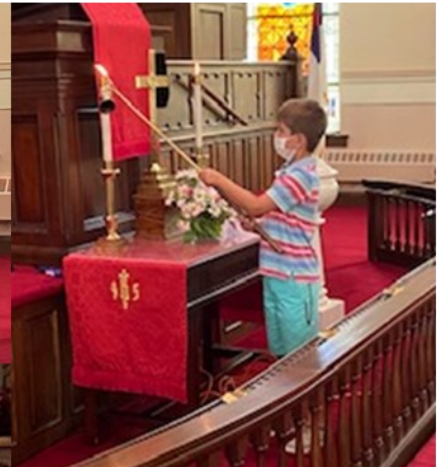
Bringing God's light to God's House